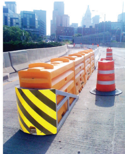
SLED™ TL-3 in Downtown Cincinnati, Ohio