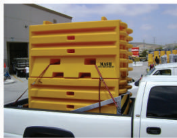
SLED™ TL-3 Transports in a Pick-Up Truck