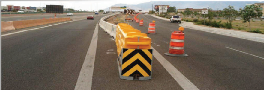
SLED™ TL-3 in New Mexico