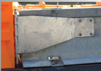
Steel Barrier Attachment