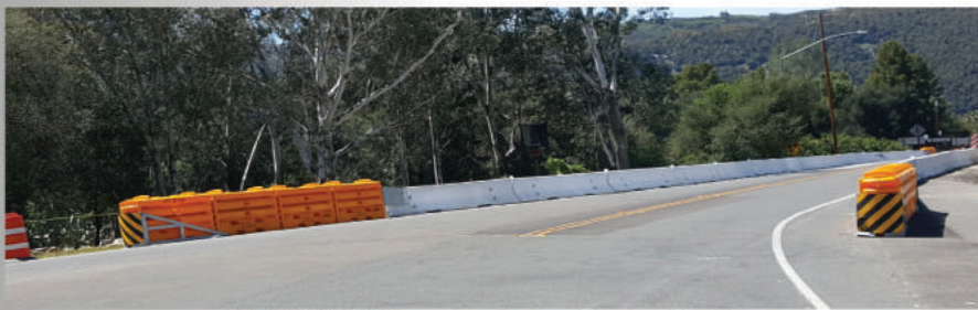
SLED™ TL-3 in use on a San Diego Roadway