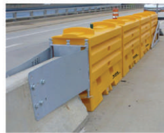
Concrete Barrier Attachment