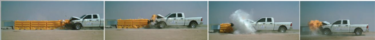
SLED™ TL-3 4900 lb. Pick-Up Truck Impact Attached to Concrete Median Barrier Wall

* Steel and plastic NCHRP 350 approved only.